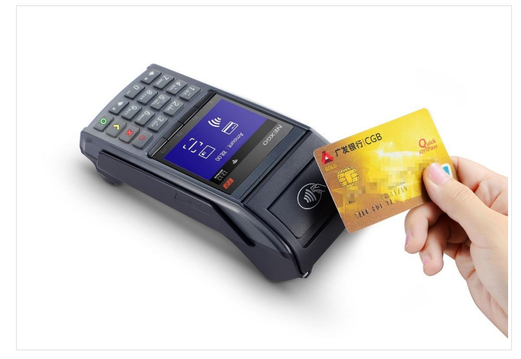
Magnetic Strip Cards IC Cards Contactless/NFC