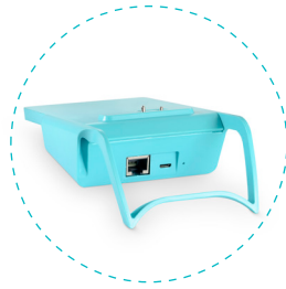
Charge base with Wi-Fi hotspot